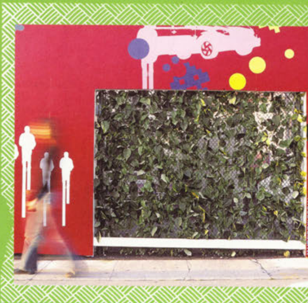
OPPOSITE Maximilian's Schell, an installation at Materials and Application by Ball-Nogues (Benjamin Ball and Gaston Nogues).